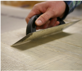
Apply bonding agent